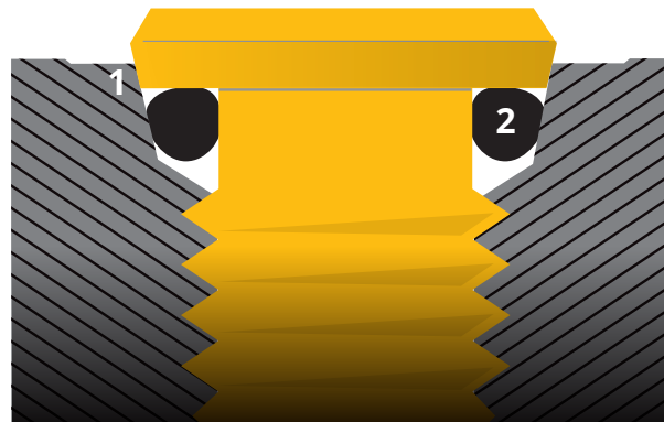
Zero-Leak Gold Plug (SAE or Metric)